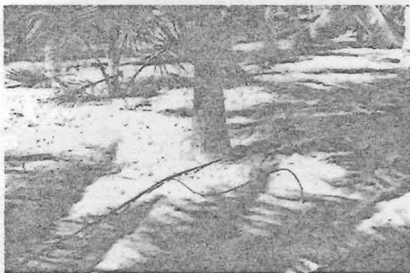
Fig. 3. Drip irrigation layout for Coconut