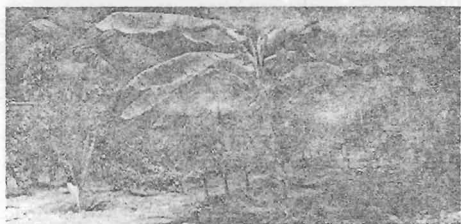
Fig. 2. Intercropping with Banana, Dioscorea & Elephant foot yam