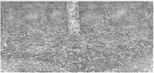
Fig. 1. Cowpea as green manure crop

Green manure crops: Cowpea, Sannhemp ( Crotalaria juncea ), Mimosa ( Mimosa invisa ), Calapo ( Calopogonium mucunoides ), Kudzu ( Pueraria phaseoloides ).