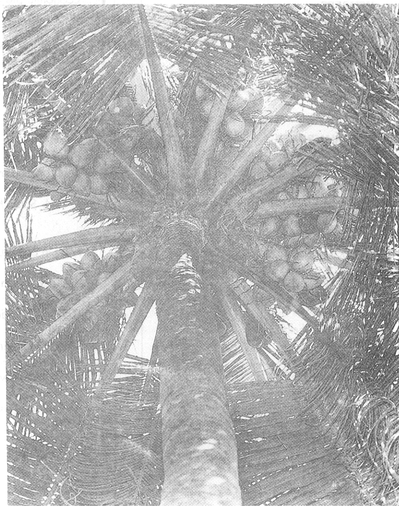
Fig. 1. West Coast Tall

Chowghat Green Dwarf as the male parent. The objective of undertaking the cross was to transfer the early bearing character of the Green Dwarf to the Tall. Under