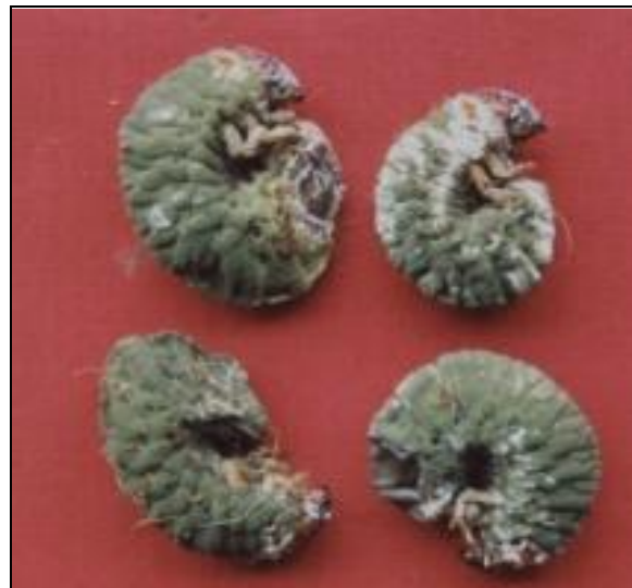
Fig: Metarhizium infested Oryctes cadavers

The entomopathogenic fungus, Metarhizium anisopliae has been used widely as a mycopesticide to control many insect pests including the major palm insect pest, Oryctes rhinoceros . The effective isolate was identified in length as M. anisopliae variety major with the spore dimension between 9-15 \mu\text{m} . The pathogenicity tests showed that at the concentration of 10^8 spores per mL, the fungus killed 100% the third instars larvae of Oryctes rhinoceros between 12 – 14 days after treatment, causing 70 -75% mycosis. Field application by directly drenched the fresh spore solution and broadcasting of solid substrate with spores onto the breeding sites was significantly reduced the Oryctes population, especially the larvae. Inoculate the breeding sites with green muscardine fungus, Metarhizium anisopliae ( 5 \times 10^{11} ) spores/ \text{m}^3 of breeding area effectively manages the rhinoceros beetle. Metarhizium has a number of advantages as a mycoinsecticide: it is relatively easy to mass produce, strains can be found with appropriate levels of virulence and specificity, and the conidia can be dried to ensure good persistence in the field and storage for over one year in cool conditions.