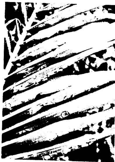
Figure 1. Oval, dark brown spots at the tip of leaflets and on the margins incited by Bipolaris incurvata on coconut leaves.