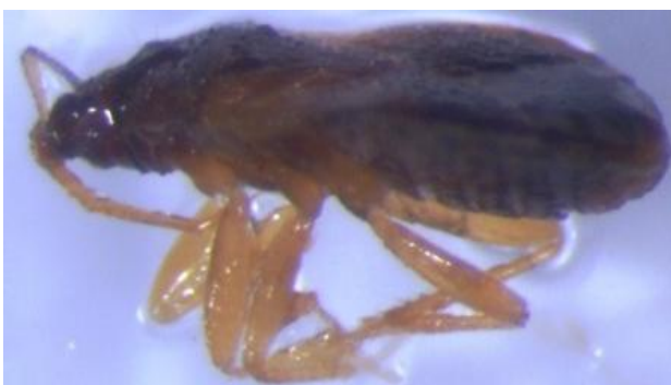
Fig 5: Predatory bug X. flavipes