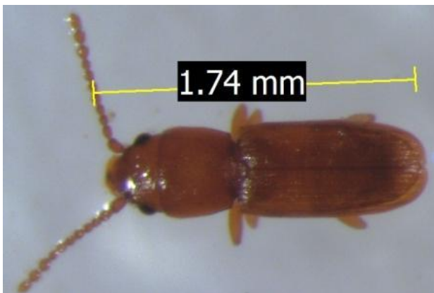
Fig 4: Adult of Flat grain beetle, C. pusillus

This pest is recorded from almost all samples collected irrespective of grade or storage period. Adults of this species are flattened, small (1.5 to 2.0 mm) in size, reddish brown in colour with long bead-like antennae (Fig. 4). It is cosmopolitan and is one the common insect pests of stored grain. Damage is usually restricted to stored product under high moisture conditions or relative humidity area. Both larvae and adults feed on stored nuts by boring inside. This insect also responsible for spreading fungal infection across the godowns. Predatory anthocorid bug Xylocoris flavipes (Fig. 5) feeding on different stages of Cryptolestes pusillus was also collected during survey.