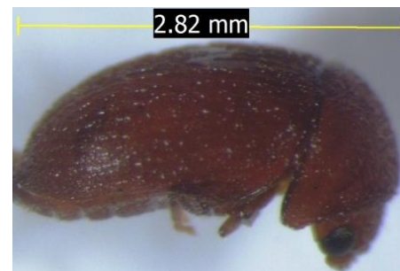
Fig 6: Adult of Cigarette Beetle, L. serricorne

Although this pest is recorded from samples belongs to all grades but severe infestation were observed in single chole and patora grade, on the basis of adult collected from respective grades. Adult of this insect is small (2 to 3.5 mm long), reddish brown and oval in shape (Fig. 6). Larvae are white with numerous long hairs (Fig. 7). Larvae feed directly on nuts and in severe infestation nuts can be pulverised. Infestation of this pest can be detected by noticing larval cocoons, frass (excrement) and dead adult beetles in stored commodity.