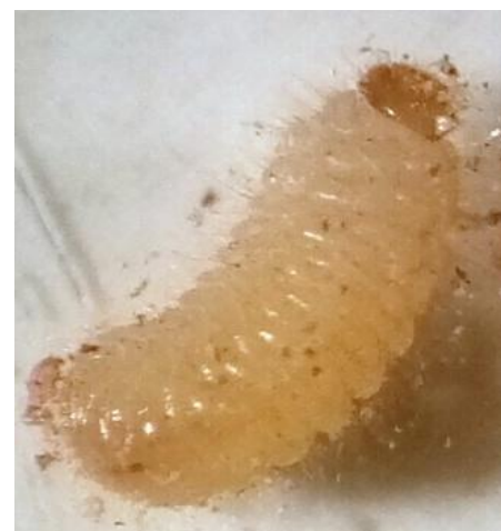
Fig 7: Larva of Cigarette Beetle, L. serricorne