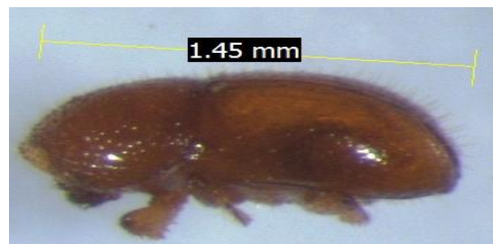
Fig 9: Adult of Palm seed borer C. carpophagus

Maximum infestation of this pest is recorded from freshly stored nuts and patora grade. The adult beetle is minute 1.2 to 2.5 mm in length and reddish brown in colour (Fig. 9). The frons is convergently aciculate with sparse, hair-like processes. Damage is caused mainly by the adult beetles which bore into the nuts and feed on internal contents. In samples with 100 % infestation with this insect were recorded.