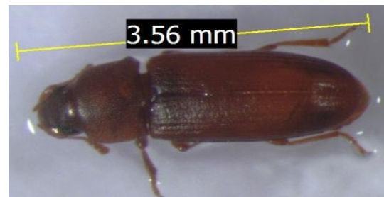
Fig 10: Adult of red flour beetle, T. castaneum .

Freshly stored nuts with less than one year period was more infested by this insect pest. Adults are a small reddish brown beetle and are about 3-4 mm long (Fig. 10). Out of total samples collected only one sample was infested by this beetle. This pest is considered as generalist feeder and damage is not readily attributable to this pest. They feed and breed on broken pieces of arecanut and imparts to a pungent odour to the commodity.