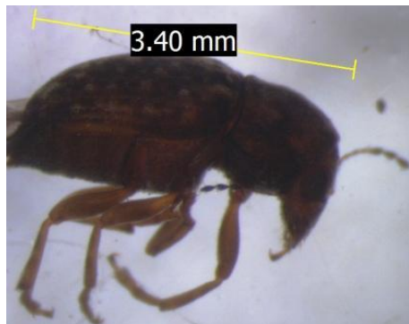
Fig 8: Adult of coffee bean weevil, A. fasciculatus

contain more moisture percentage which may be the reason for more infestation of this beetle to the stored nuts. The adult beetle is small (3-4 mm) in size with a humped body outline and long legs (Fig. 8). The dorsal side is interspersed with dark and light brown and the antennae are long with a three-segmented club. Both adult and grub damage the nuts by making holes of 1.5-2.5 mm diameter.