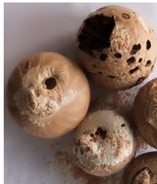
Fig 1: Arecanut sample infested by storage insect pests.

All of the insects recorded during survey damage the nuts by drilling holes into them followed by feeding and pulverising the nuts (Fig. 1). In case of heavy infestation some portion of nuts converted into fine powdered dust. All stages of insects were recorded inside the infested nuts. Highest percent incidence of storage insect pests was recorded in patora followed by fresh nuts, single chole and double chole (Fig. 2). The probable reason for this pattern of infestation may be availability of cracks on patora leads to enhance oviposition and multiplication of storage pests. Highest incidence of flat grain beetle C. pusilis with 58.30 percent population was recorded during the study. Trend of other insect species are depicted in Fig. 3.