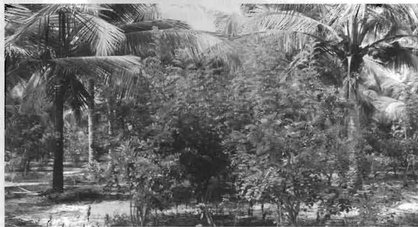
Alley cropping of glyricidia in coconut

by vermicomposting in trenches dug in interspaces of four coconut palms yield on an average recovery of 70% in a composting period of 90 days. The average nutrient composition of the vermicompost recovered will be around 1.2-1.8 % (N), 0.1-0.2 % (P) and 0.2-0.4 % (K), organic carbon (17.84%), and C/N (9.95:1.00). Total microbial counts and beneficial microbial population will also be more in the coconut leaf compost compared to the base material. This enables disposal of coconut wastes in a less expensive way and eco-friendly