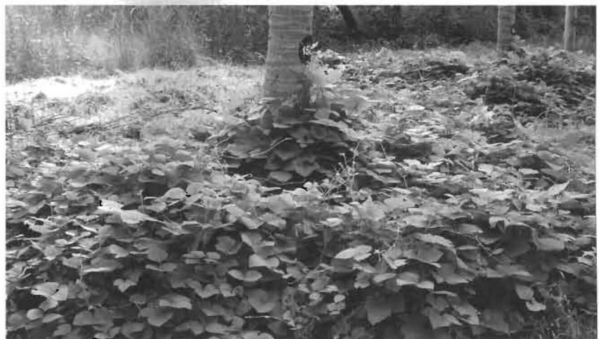
Green manure crops grown in coconut basin

Generation of large quantities of nitrogen rich biomass is also possible through the cultivation of the fast growing perennial leguminous green leaf manure tree crop, Glyricidia in the coconut plantations. This can be very well grown along the borders of coconut plantation and can generate adequate amount of nitrogen rich green leaves. It can also be raised in littoral sandy soils where no other green manure can establish. The tree is propagated either through vegetative cuttings or seeds. One meter long stem cuttings or 3 to 4 month old seedlings raised in poly bags/raised beds can be used for planting. It is preferable that the planting season coincides with the monsoon (South West / North East monsoon) for better establishment. Spacing of 1 m x 1 m can be adopted. Two rows of glyricidia can be planted along the boundary of coconut garden in a zig zag manner. Plant stem cuttings or seedlings in an upright position in pits of 30 cm 3 . For better establishment, a basal dose of 50 g of rock phosphate per pit may be