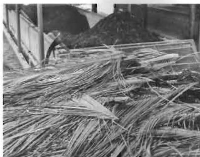
Production of vermicompost