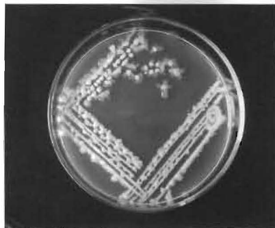
Bacillus sp from improving coconut growth

Micro organisms present in the soil play an important role in nutrient solubilization, mobilization, uptake and recycling. They have very wide potential as they increase nutrient availability, stimulate plant growth, control soil borne pathogens and accelerate decomposition of organic material, which help to increase crop