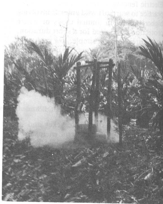
Figure 3. Cracker burst emitting gunshot sound and smoke.