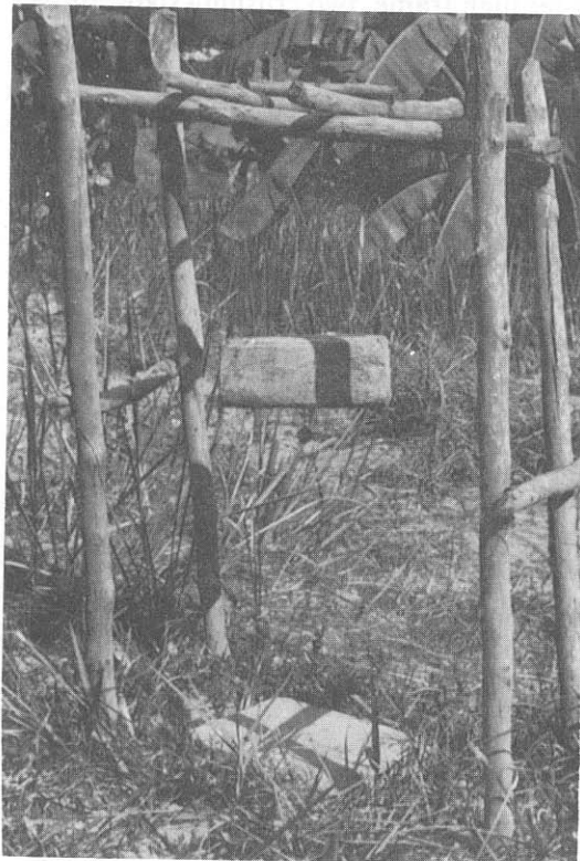
Figure 2. Junction box.