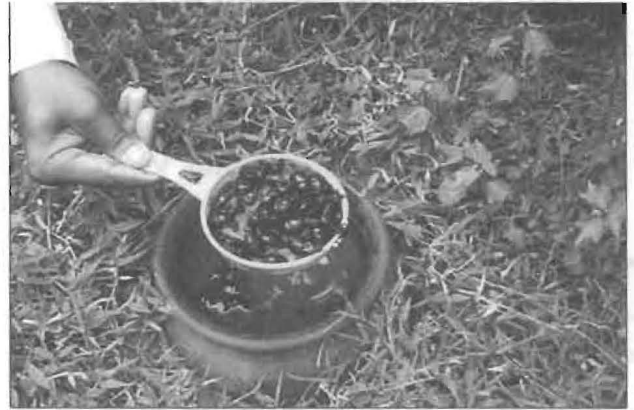
White Grubs collected