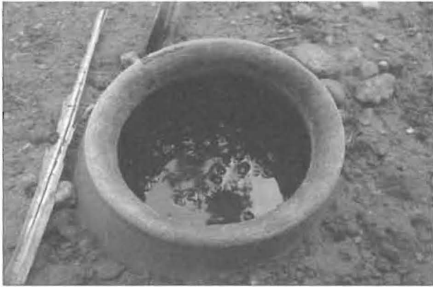
Mud pots filled with fermented castor solution buried underground upto neck