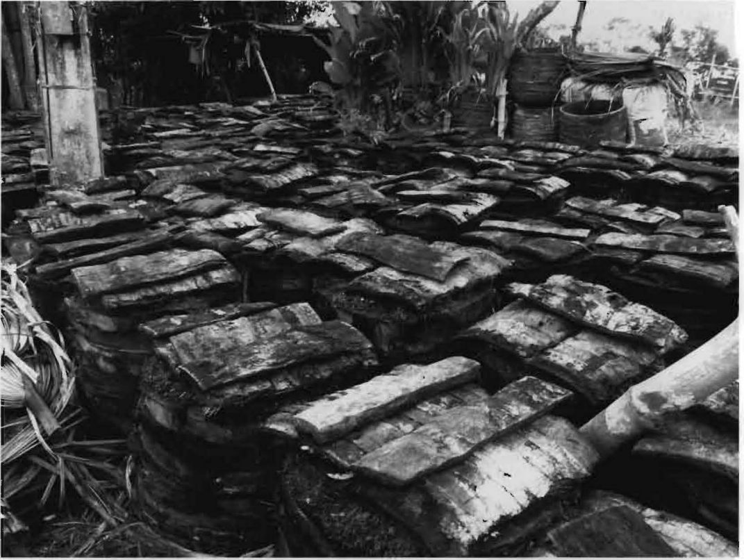
10. Palm trunks being used to grow larvae at a red palm weevil farm in Thailand.

increasing frequency as it enters southern California from Mexico (Hoddle 2011c).