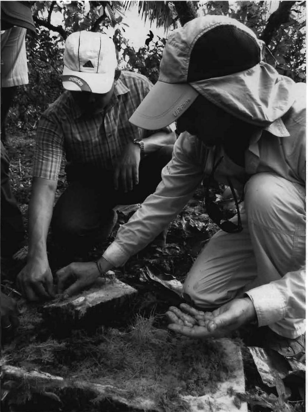
6. Extracting larvae from the infested trunk.

nature is time consuming, as it means doing one of two things: (1) cutting down infested coconut palms and dissecting them with a chainsaw to access the larvae living within the apex of the trunk (Figs. 4–7), or (2) deliberately felling sago palms ( Metroxylon sagu ) to promote weevil colonization, after which larvae can be