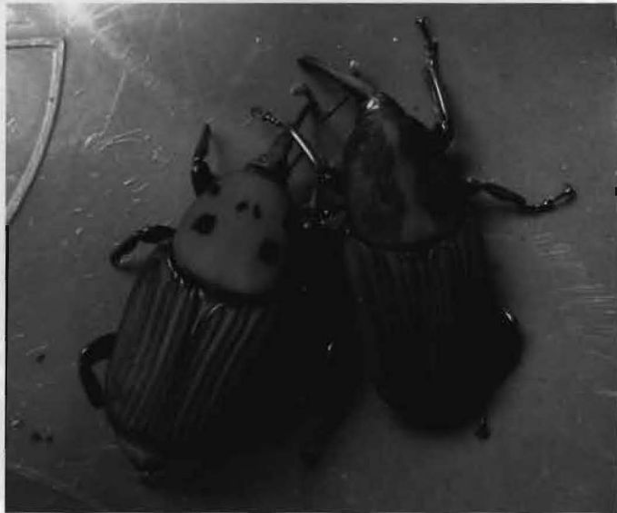
1. Red palm weevil color morphs.

Department of Entomology, University of California, Riverside CA 92521 USA mark.hoddle@ucr.edu