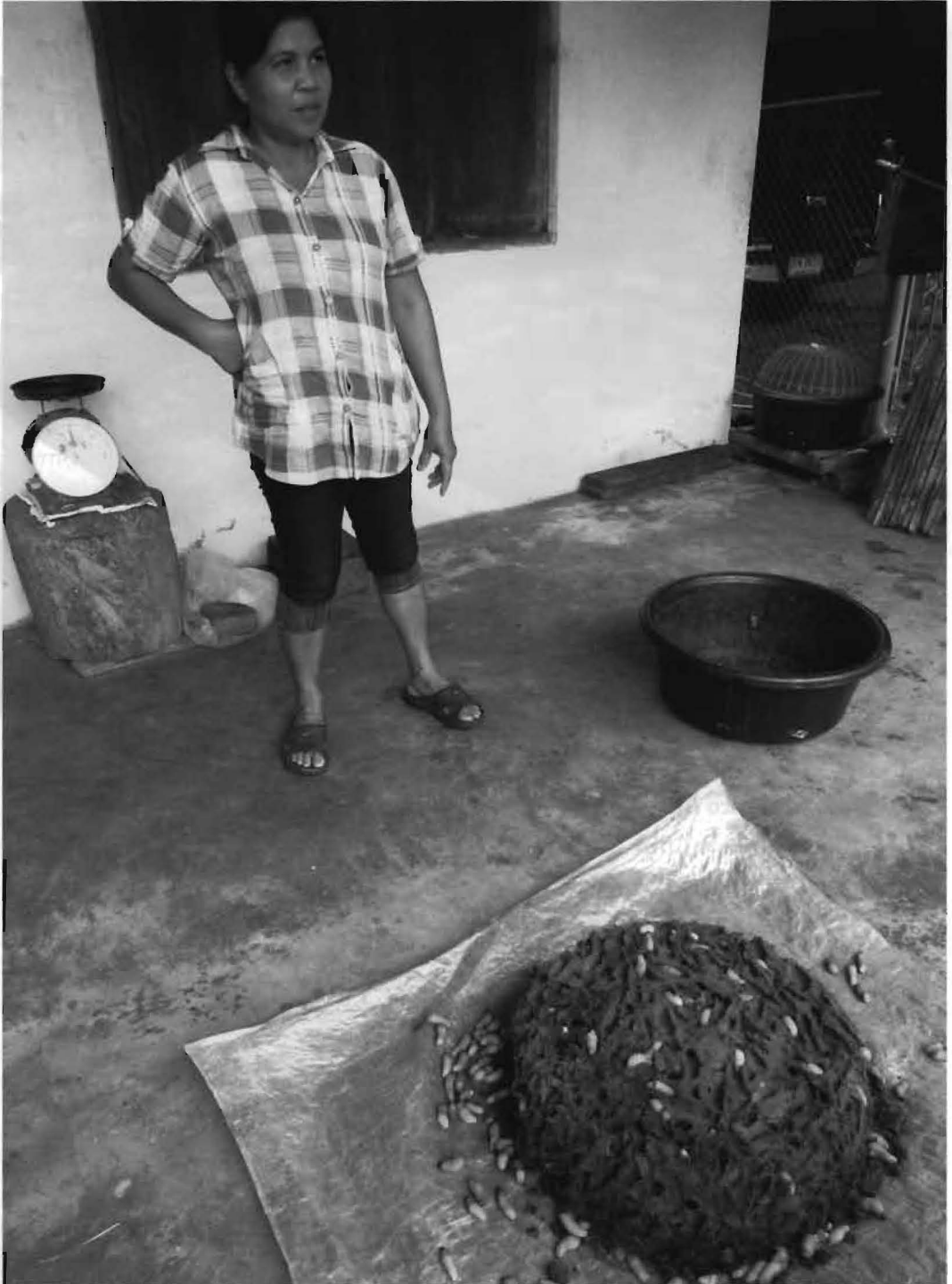
9. A bowl of palm mash tipped out to show the developing larvae.

identified infested palm trees and treated them with contact and systemic insecticides (Hoddle 2011a & b). Later examination of treated palm trees that were felled and dissected failed to detect any evidence of R. vulneratus activity (Hoddle 2013b). If R. vulneratus is declared to