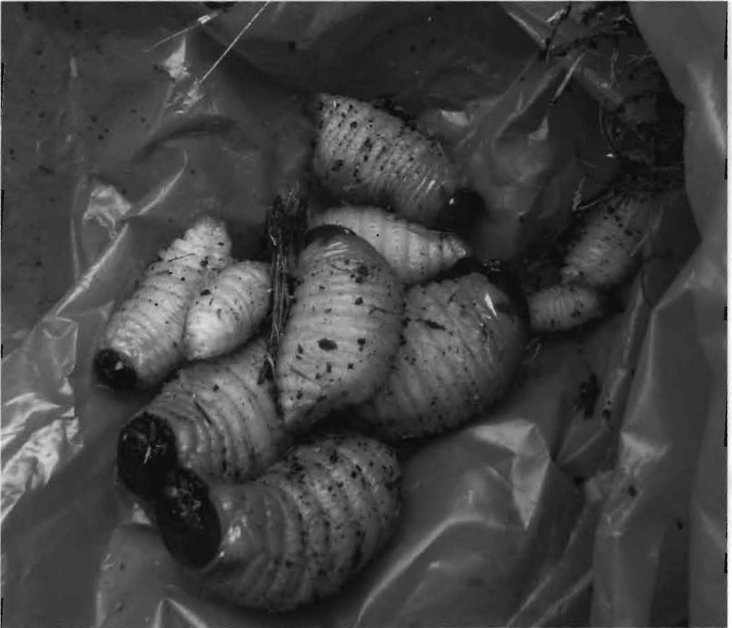
7. Larvae are stored temporarily until they can be cooked.

An alternative and much more efficient approach is to farm red palm weevil. This is a commercial enterprise in Thailand (see this video from Thailand – even though it is in Thai it is still fascinating and basically self-explanatory www.youtube.com/watch?v=mmTOXLwJELI ).