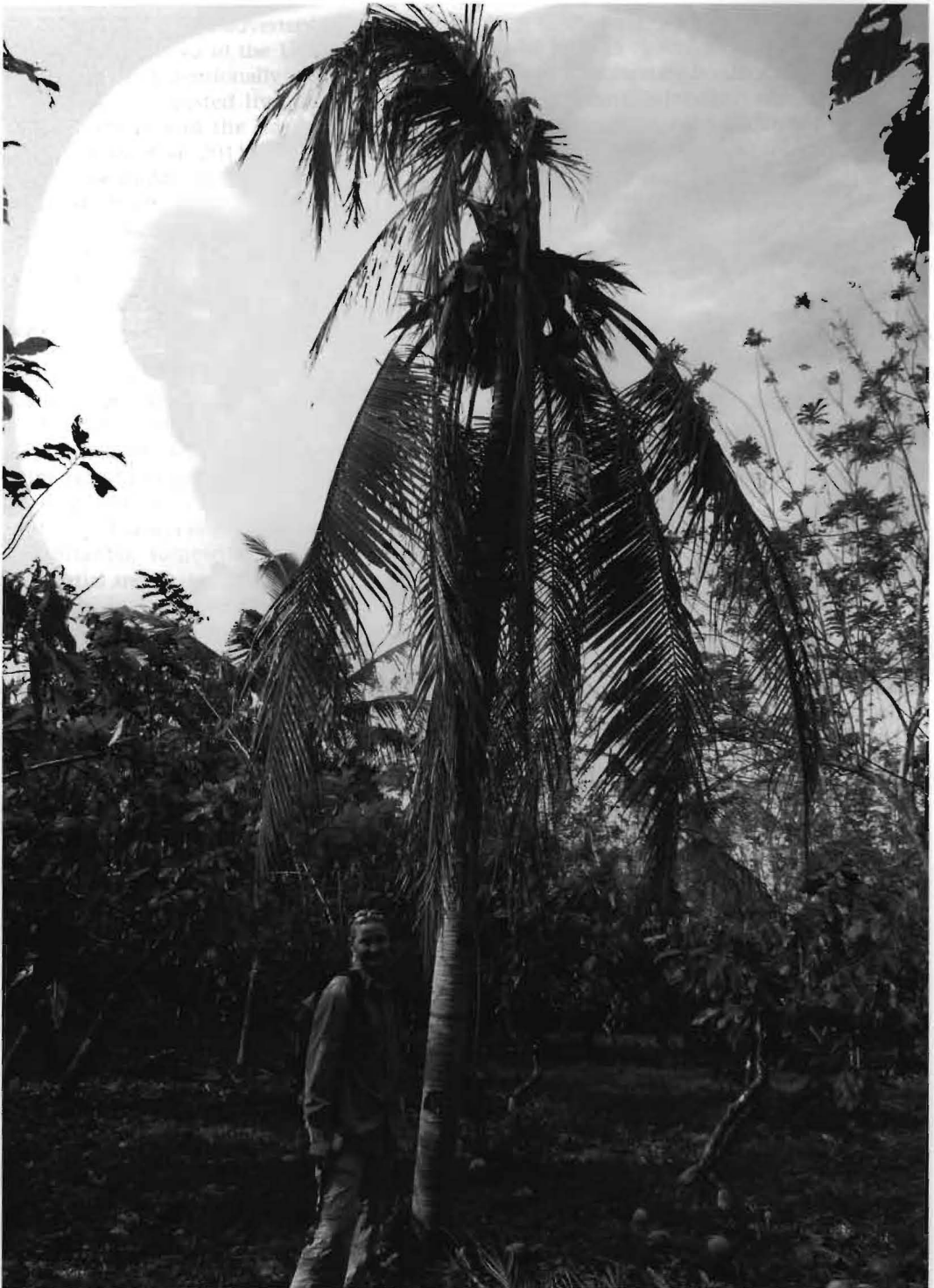
4. Harvesting red palm weevil first requires locating a coconut palm exhibiting signs of infestation.

Jones et al. 2013). These two species, given their current geographic distributions may have evolved from a common ancestor after the splitting of the Isthmus of Kra in Thailand by ancient seaways.