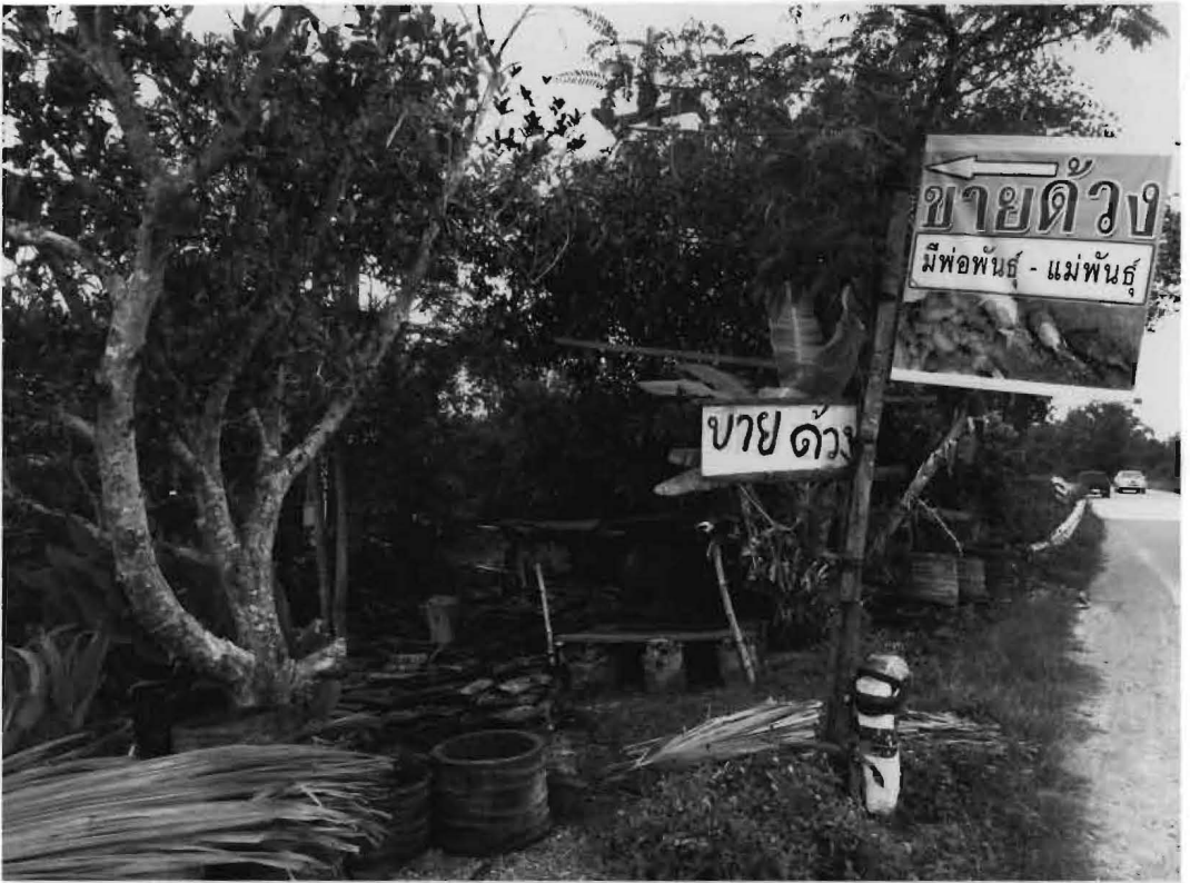
8. A roadside sign advertising red palm weevil larvae for sale in Thailand.

as containers for growing plants! It is not surprising therefore that the FAO is promoting insect farming as a cheap and efficient alternative to rearing pigs, cows and goats for protein (van Huis et al. 2013).