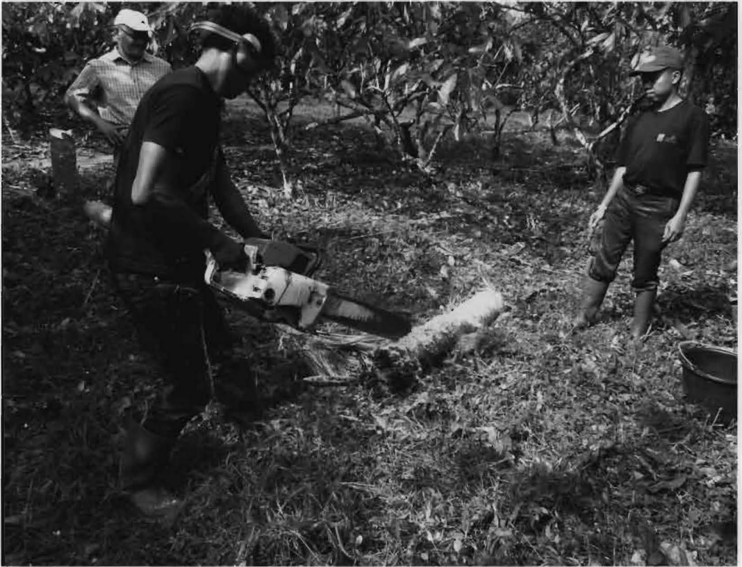
5. Harvesting red palm weevil requires felling and dissecting the trunk with a chain saw.

Indonesia, Hallett et al. (2004) correctly determined that they were working on just one species, despite pronounced color variations, as their test weevils mated, produced offspring, were sympatric in infested coconut palms and responded to the same aggregation pheromone. DNA analyses showed no differences to imply different species were being studied. The problem with this work was that Hallett et al. (2004) were actually studying R. vulneratus , not R. ferrugineus (which is not present in Indonesia) as they assumed, and their recommended synonymy was incorrect.