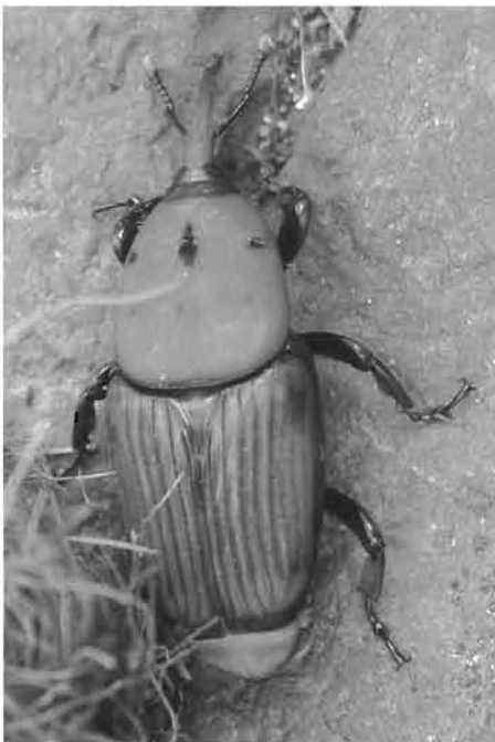
1 (left). Adult Rhynchophorus ferrugineus . 2 (right). Phoenix canariensis severely infested by Red Palm Weevil.

A preliminary survey by visual inspection was initiated immediately after the first detection of RPW in a Sicilian historical town (Acireale), in the fall of 2005 (October) and was concluded in the spring of 2006 (May). The survey included heavily infested sites and bordering areas in botanical parks, downtown gardens and historic villas. 1140 P. canariensis , 81 Washingtonia filifera , 58 P. dactylifera , 50 Howea forsteriana and 6 Chamaerops humilis in 162 sites were visually inspected in an area encompassing about 150 km 2 in Catania province. These areas were surveyed again by visual inspection, in summer (July–September 2006) and fall (October–December 2006). Data collected during the three surveys were compared in order to assess the progression of the infestation over the year. Palms with symptoms were visually inspected, sometimes with the help of a lifting device and checked for the presence of larvae and cocoons. All trees were ranked for tallness with the aim of determining whether plant height was a predisposing factor to insect infestation and damage. For conciseness, all the homogeneous sites were grouped together and presented as