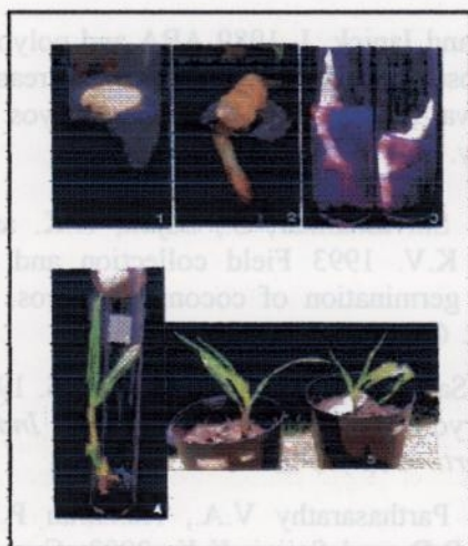
Fig. 1-5 In vitro retrieval of cryopreserved embryos, subjected to desiccation pretreatments

*Hyperhydricity, swelling of the embryos