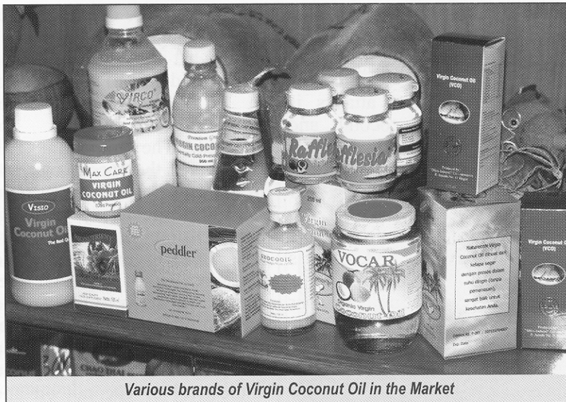
Various brands of Virgin Coconut Oil in the Market