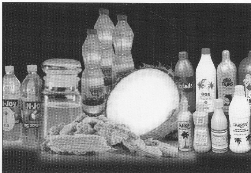
Different Brands of Coconut Oil in the Market

Coconut oil although it is saturated oil has medium chain fatty acids unlike fatty acids found in meat, butter, and cheese. Coconut oil is neutral oil i.e. it neither elevates the serum