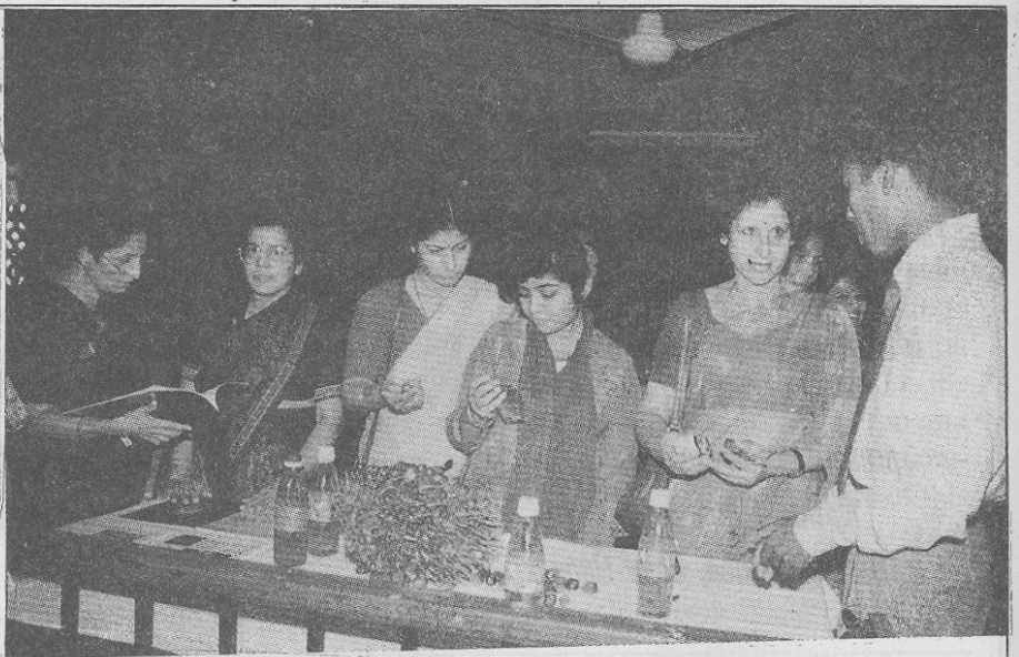
➤ MPOPC booth at National seminar on Health and Dietary fats at New Delhi held on 29th October '96.