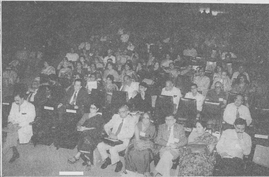
➤ Nutritionists, Economists and Medical Doctors participating in the seminar.