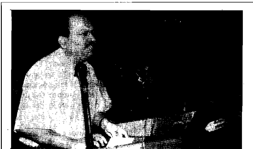
Dr. Harsha Vardhan, State Minister of Health and Chief Guest at National seminar giving his inaugural address.

Indian Academy of Pediatrics Nutrition Society of India