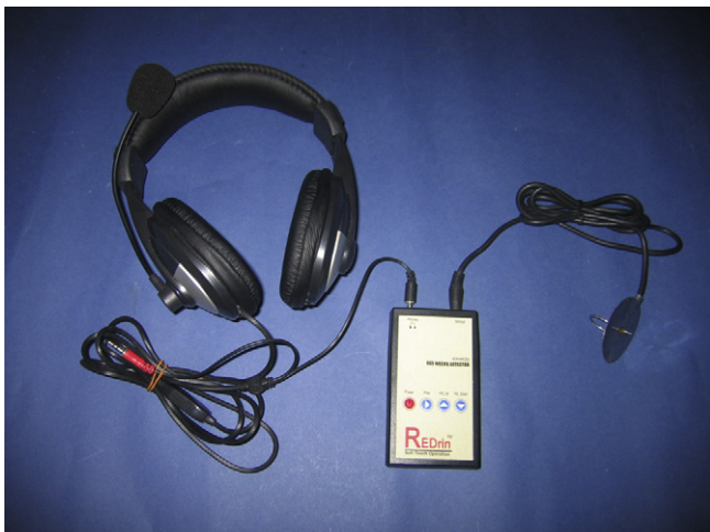
Fig. 3. The acoustic device comprising the sensor, main unit and the set of headphones.

Out of the 159 palms checked in study 2, 103 palms showed symptoms of infestation. Of these, 97.1% palms (Index 1) were accurately detected as infested. Also, out of 56 palms without symptoms, 92.9% (Index 2) were correctly detected as uninfested (Table 3). Out of the 103 palms that showed symptoms of the damage, 28 palms showed only very slight symptoms such as formation of gum from the liquid oozed out from the tissues, which could be easily missed by the grower checking palms by the conventional way.