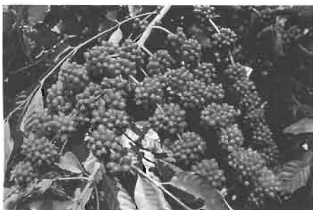
Coffee-Congensis x Robusta (CxR) hybrid of Robusta

India is the seventh largest coffee producer and the third largest in Asia. The planted area of coffee is more or less equally divided between Arabica and robusta types in India. But in terms of production, the share of Arabica coffee, which was more than 50 per cent till 1980s, has declined to 31 per cent during 2012-13. The state of Karnataka accounts for 55.6 per cent of area under coffee and 70 per cent of the coffee production in the country.