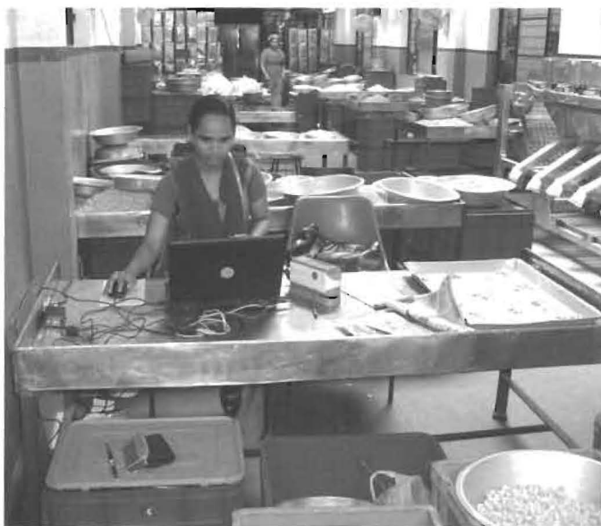
Processing in cashew

The sector has shown considerable inertia to adopt modernization. This is visible across the prevalent practices followed in post-harvest operations, level of technology adoption, mechanization and cultivation practices. There is an urgent need for modernization of plantation crop sector and allied activities. The small size of holdings in plantation crops presents both challenges and opportunities for sustainable growth. The small holding size brings along with it, a host of problems associated with it. Developing suitable marketing channels and value chains suited for widely disaggregated production environment is one of the biggest challenges faced in almost all the plantation crops. The technologies available, especially in mechanization of operations, are often not suitable for adoption in small holdings. This presents considerable challenges for increasing the efficiency of production through mechanization.