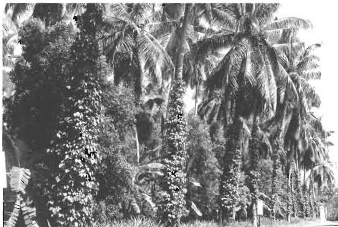
High-density multispecies cropping system

PLANTATION crops have always maintained a place of interest in socio-economic and political mainstream discourse due to its trade significance and international character of the produce from the sector. Cultivation of plantation crops in India also has a rich and varied history. It has played a key role in the development and transition from a subsistence agrarian economy to market-oriented commercial cultivation. Each crop in the plantation crop sector has its own peculiarities and distinct historical and economic context of establishment and development. Though the organized development of some of the plantation crops like tea, coffee and rubber was initiated during the colonial era, cultivation of coconut, arecanut and spices were already well established even at that time.