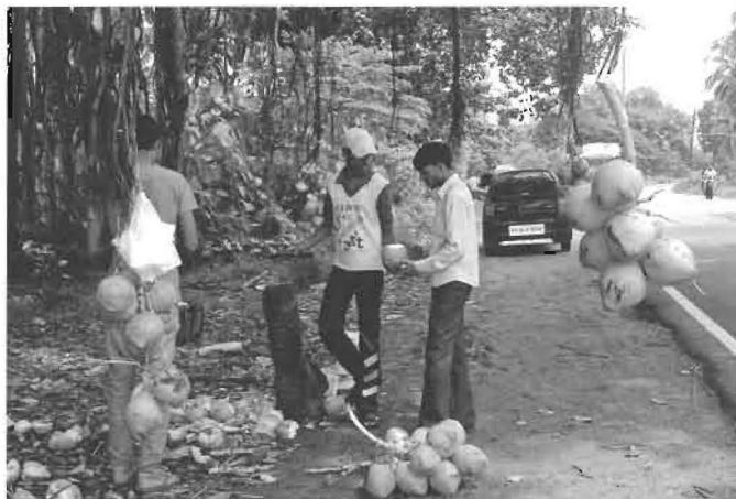
Tender nut sales

The direct and indirect employment generation potential of the sector is well documented. The tea industry is India's second-largest employer with over 3.5 million workers employed across the tea-growing estates. The average number of persons employed daily in coffee plantations is estimated to be 0.62 million during 2012-13. In rubber plantations, the average daily employment increased from 0.16 million in 1976 to 0.46 million in 2010-11. Similarly other plantation crops also provide productive employment to the significant number of workers. The indirect employment provided through the respective industries and its associated firms will be more than the direct employment provided by the crop production activity in plantation crop sector since most of the crops require extensive post harvest processing and value-addition before its final consumption.