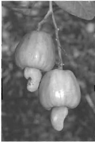
Red coloured apple

India is one of the leading producers, processors and exporters of cashew in the world. India stands third in the production of raw cashew nut in the world behind Vietnam and Nigeria.