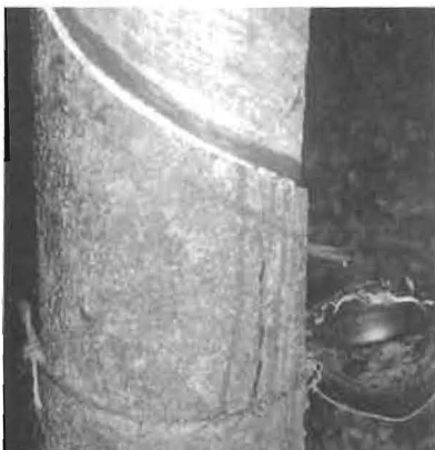
Rubber-panel application for tapping

India holds a place of pride among the natural rubber producing countries in the world. The productivity of rubber in India is the highest in the world and the country is the third largest consumer of natural rubber. It is estimated that the annual turnover from the rubber industry