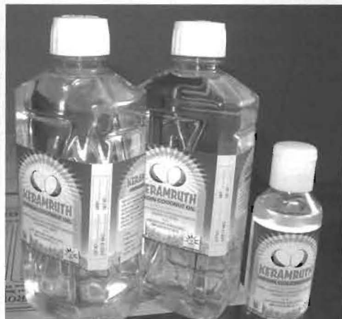
Keramruth virgin coconut oil