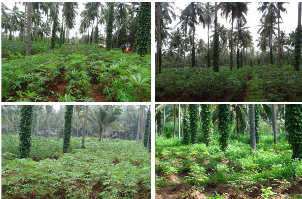
Fig. 1. Validation trial on organic management of cassava in coconut garden at ICAR-CPCRI, Kasaragod

in the integrated or conventional practices (Table 2). At the maturity stage, leaf retention also followed a similar trend. The integrated or conventional management retained significantly more leaves. Leaf fall was to the same extent in the different management options during the course of experimentation. It was more in conventional or integrated treatments and lesser in organic or traditional treatments, where chemical fertilizers were not used. The total number of leaves was also significantly higher in the conventional or integrated practices. Stem girth also did not vary significantly due to the production systems. However, conventional or integrated practices resulted in greater stem girth. Plant growth was promoted under conventional or integrated practices, probably due to comparatively faster release and availability of nutrients from chemical fertilizers over organic manures. The partial shade in the coconut garden might have slowed down the decomposition process of the organic manures resulting in slower availability for uptake by the