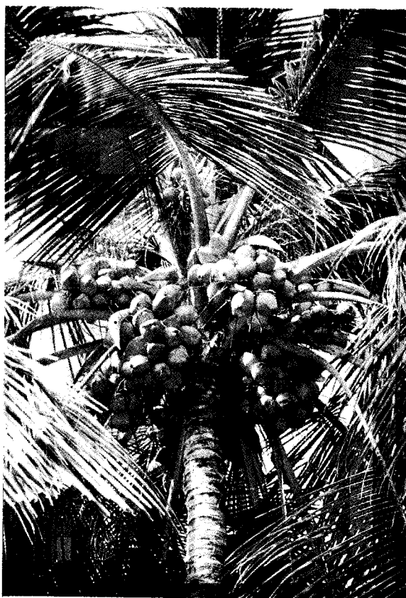
Fig. 5. Chandrasankara (CODxWCT)

cious and high yielding compared to local cultivar, West Coast Tall, under irrigation and good management.