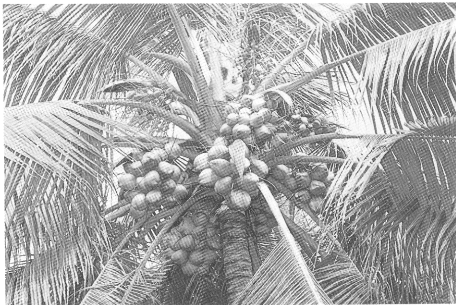
Fig. 6. Chandralaksha (LO x COD)

Solomon, J.J., Govindan Kutty, M.P. and Nindhans, F. 1983. Association of Mycoplasma like organisms with the coconut root (wilt) disease in India Z. Pflkrankh pflschutz , 90:295-297.