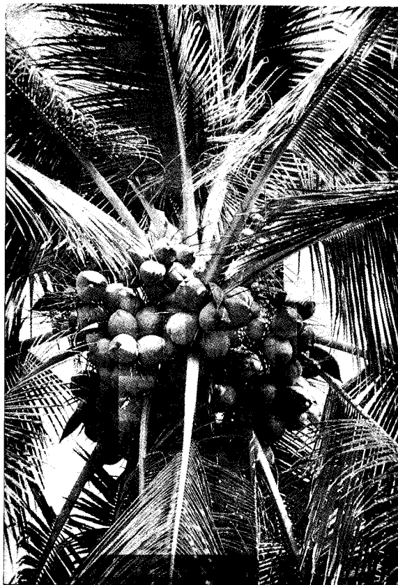
Fig. 4. Philippines Ordinary

Ever since the report of heterosis in Tall X Dwarf hybrids by Patel (1973), various hybrids involving tall and dwarfs have been evaluated for their increased productivity. In the immediate years following the discovery of hybrid vigour in coconut, the emphasis was on the production of Tall x Dwarf hybrids. These hybrids were pre-