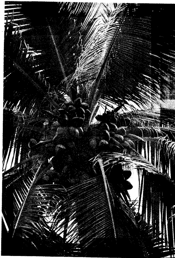
Fig. 1. Chandrakalpa

The crop improvement in coconut through selection and hybridization has been one of the major objectives of coconut research workers for the last 65 years. The genetic improvement in coconut is a difficult and time consuming process because of the long gestation period, requirement of large area for experimental planting, resources required for experimentation, low seed multiplication rate and lack of a reproducible clonal propagation technique. With all these limitations, India was the first country in the world to exploit hybrid vigour in coconut in a cross between West Coast Tall x Chowghat Green Dwarf (Patel 1937). This discovery was a significant land mark in the history of coconut improvement and paved the way for the success-