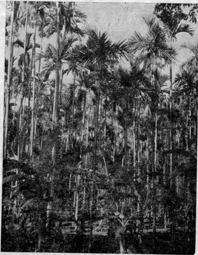
An arecanut plantation in Mysore. Banana is also grown in it

imum returns per unit input to the farmers. Crops which love shade or those which can withstand the canopy of arecanut palms and the heavy drip during the monsoon are to be preferred. They should be able to utilise the filtered light to the maximum. It is also necessary that the crops which go with areca do not have similar requirements of plant nutrients as far as possible. It will also be an advantage if the root systems of the crops are confined to different zones so that competition for moisture and nutrients is minimised. The crops chosen as intercrop or mixed crop also vary from tract to tract, though a crop like banana may be more universally grown. If growers of Sirisi (Karnataka) prefer cardamom and pepper as intercrops, the planters at Dakshina Kannada of Karnataka, select pepper, banana and yam as best suited to the locality. The areca growers of Assam prefer citrus while the growers of Kerala grow Dioscorea , yams and tapioca. Thus the kind of intercrop chosen will vary depending upon several factors like the agroclimatic conditions of the region, the demands and preference of the local market and the personal likings and needs of the farmer.