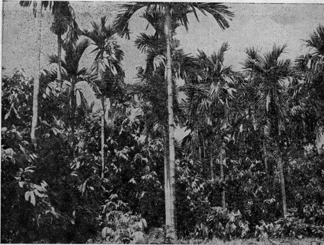
Areca-cacao mixed cropping

Central Plantation Crops Research Institute, Regional Station Vittal, Karnataka