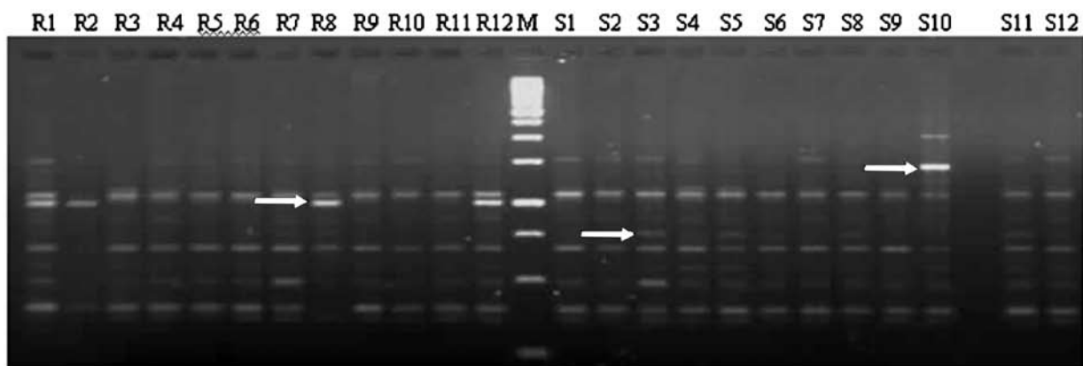
Fig. 1. Resistant (R1- R12) and susceptible (S1-S12) palm samples are marked over each lane in the 1.5% gel. Polymorphic bands are marked with arrows. 1 kb ladder is marked as M.

In the present study, the productivities of the prominent dominant markers, ISSR and RAPD were incorporated with the gene specific markers.