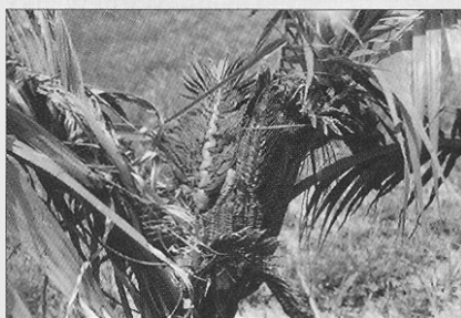
Fig. 5. Tight fusion and poor unfurling of newly emerged leaves

nitrogen rich soils during summer, boron deficiency symptoms are obvious. Initially the symptoms appear as poor unfurling of young leaves. Later these leaves show