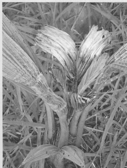
Fig. 3. Mortality of growing buds in acute boron deficiency

better assessed with enhanced levels of phenols and polyphenol oxydase enzyme within the cells. Also the levels of anti-oxidants such as vitamin C will come down drastically.