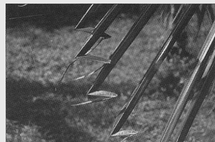
Fig. 7. The Hook Leaf symptom

throughout the length or fusion may be restricted to basal or distal parts of the spear leaves (Fig. 5). At