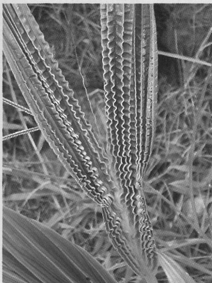
Fig 1. Typical wavy patterns on the leaves of young palms in the nursery

From the soil solution , boron is passively absorbed in the form of boric acid and this process is primarily influenced by the factors such as soil acidity, structure, texture, soil water status and clay and organic matter status.