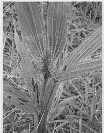
Fig. 2. Initial symptoms of drying of young leaves

Strengthening the cell wall and plasma membrane is the supreme function of boron molecules within the cells. The cis -diol molecules originating from boron protect cells from destructive peroxidation effects of free oxygen radicals. Under boron deficiency, cell membranes develop holes and cellular functions including proton pumping will be deactivated. This condition could be