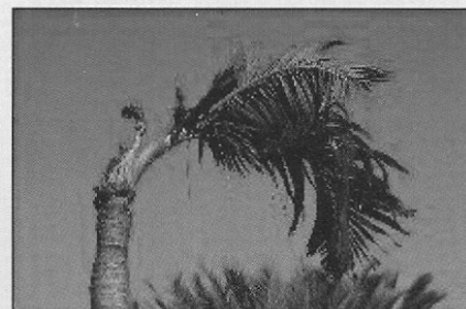
Fig. 8. Characteristic unidirectional bending of the crown

chronic state, multiple unopened spear leaves may be visible at crown apex (Fig. 6). The sharply bent leaflet tips called 'hook leaf' is yet