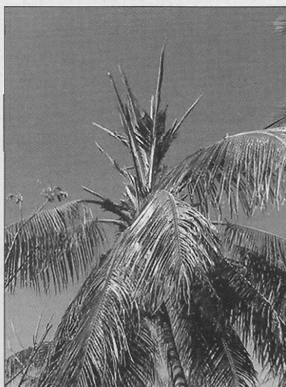
Fig. 6. Multiple unopened spear leaves at crown apex

typical wavy patterns on the leaflet midribs (Fig. 1). Advance stages lead to drying of young leaves from the tip (Fig. 2) and finally the mortality of growing buds (Fig. 3). In young