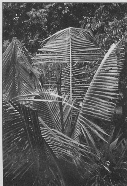
Figure 4. Series of inverted 'V' shaped truncations on leaf

Boron is essential for the normal growth and development of coconut palms aging from 2 months to 14 years. In coconut nurseries raised in