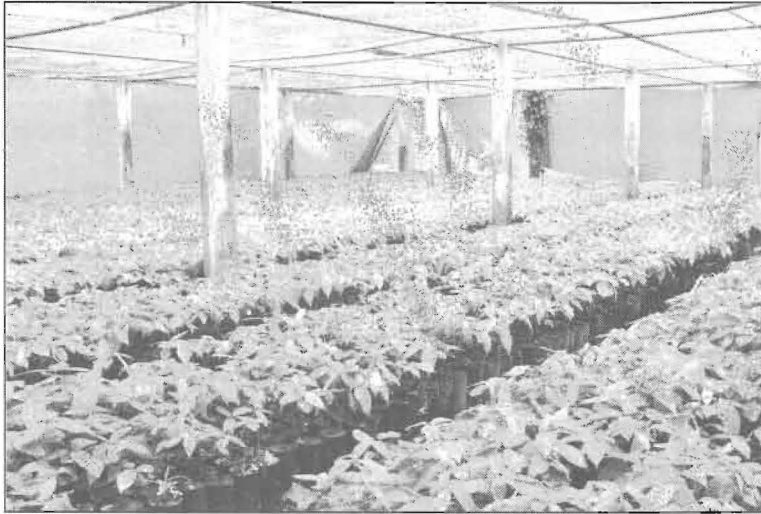
Figure 4.2: Cocoa Nursery Seedlings.