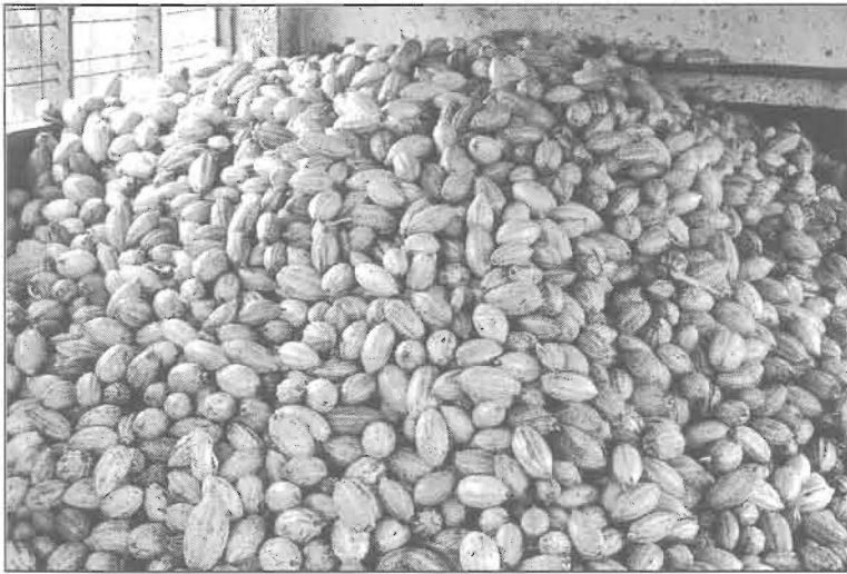
Figure 4.5: Harvested Mature Pods.