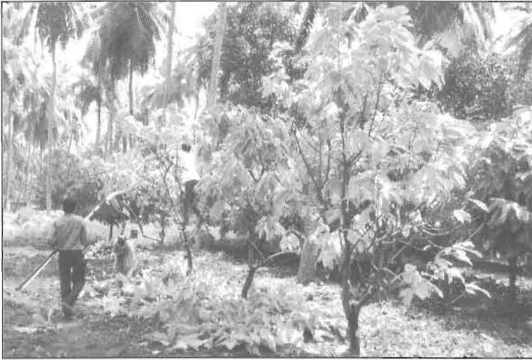
Figure 4.4: Pruning of Cocoa Plants.

necessary to regulate the canopy size and shape of plants so that the main crop is not affected. Proper and systematic pruning is essential in cocoa cultivation. The proper pruning of cocoa ensures adequate ventilation in garden; maintain tree height, makes spraying and harvesting operations easier. Pruning is usually done annually in July-August. Pruning reduces the number of unnecessary branches, and allows more light and wind to pass through the branches which reduces pest and disease levels and also amenable for easy harvest of pods.