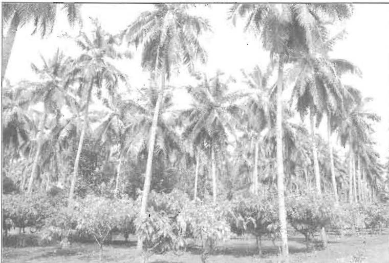
Figure 4.3: Cocoa as Mixed Crop in Coconut Garden.

The optimum spacing between cocoa trees is the distance which will give the optimal economic return of cocoa per unit area, always considering the stability of the organic production system. Factors such as labour requirements, establishment costs for the plantation and cost of inputs, possible losses due to pests and diseases etc. will also play significant role in finalization of spacing in cocoa plantation. In addition, the spacing is determined by factors such as the vigour of the trees, the soil and climate or the selected planting system. Providing optimum spacing is one of the important factors, which has a direct bearing on the yield of the crop. The optimum spacing for cocoa is one, which will give maximum economic returns. The spacing adopted for cocoa in the major cocoa-producing countries is highly variable and each country has adopted certain spacings which have become traditional. The spacing followed varies from as low as 1.0 m x 1.0 m in Trinidad to as high as