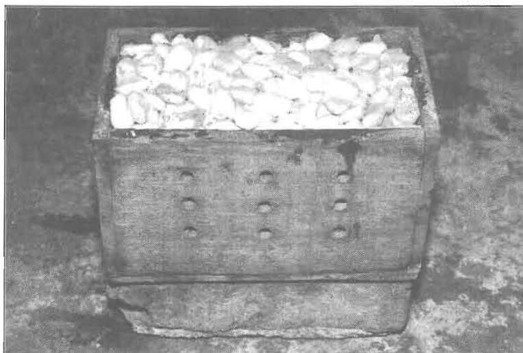
Figure 4.6: Fermentation of Beans.

be properly disposed off to avoid environmental pollution of the organic farm.