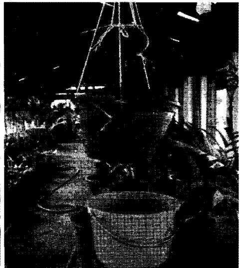
Fig. 36.3 Vermiwash collection