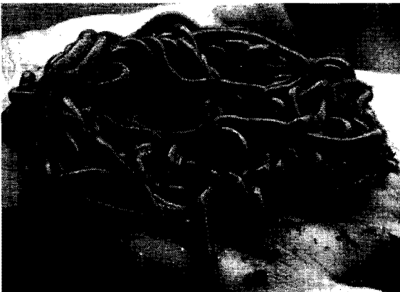
Fig. 36.2. Earthworm, Eudrilus sp dark in colour