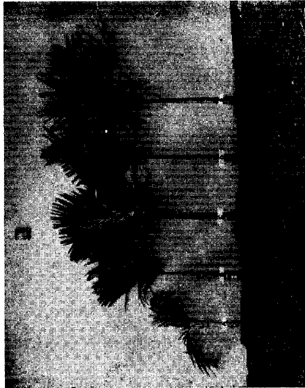
Fig. 1. Effect of various nematicides on the growth of arecanut seedlings in comparison to the untreated control.