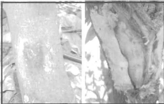
Fig.3 Stem canker

Symptoms: Canker appears on surface of the the stem, as round to oval shaped dark brown discolored lesions. Later, reddish brown colour oozing can be seen from the infected area. In the advanced stage of infection results in girdling of stem. If infection noticed at the collar region, it spreads fast and infects the root system. Hence, water and nutrient uptake will be severely impaired. Yellowing and wilting of the foliage will be noticed under severe infection.