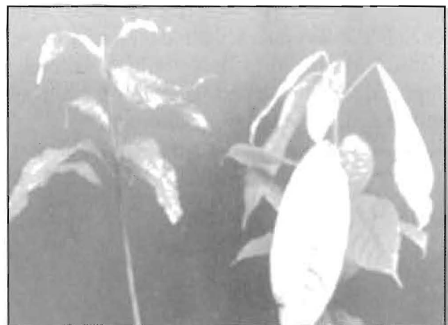
Fig.6. Zinc deficiency symptoms

Symptoms: Mottling and crinkling with wavy margins are the characteristic symptoms noticed in leaves. Such leaves later malformed. Younger leaves become small, narrow and sickle-shaped (Fig.6).