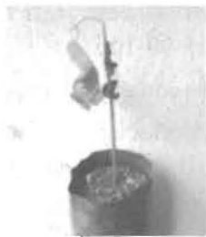
Fig.1. Symptoms of seedling dieback

Symptoms: Defoliation and dieback are the characteristic symptoms of this disease. Infection starts from the tip of the stem and proceeds downwards as dark brown to black water-soaked linear lesions (Fig.1). Infection spreads to the entire stem causing wilting, defoliation and ultimate death of the seedlings. Infection also noticed in grafted or budded region and proceeds on both the sides.