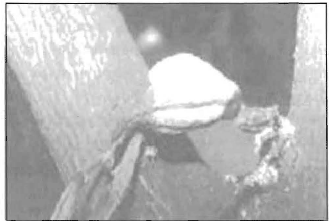
Fig. 4. Cherelle wilt

Symptoms: Large number of cherelle or young pods of 2-3 months old will dry up and remain on the trees as mummified fruit. February-May considered as critical period for infection. Two kinds of cherelle wilts are observed i.e. physiological and pathological wilt.