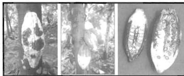
Fig.2. Black pod disease

Symptoms: Initially, small, circular water-soaked lesions were noticed on the pod. Later, it turns to dark brown colour and covers the entire pod. A white thread like mycelial growth consisting of numerous sporangia of the pathogen appears on the pod surface. In severe infection, discoloration of beans was also noticed.