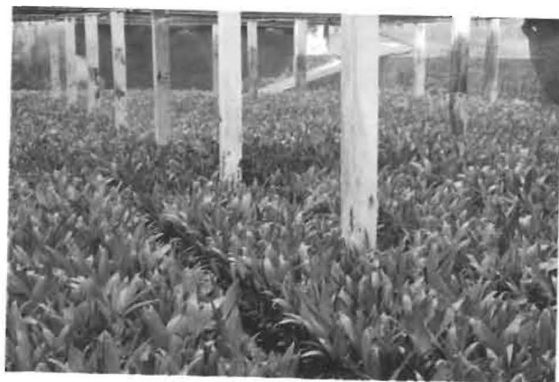
Poly bag nursery