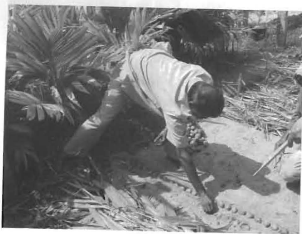
Sowing in nursery bed