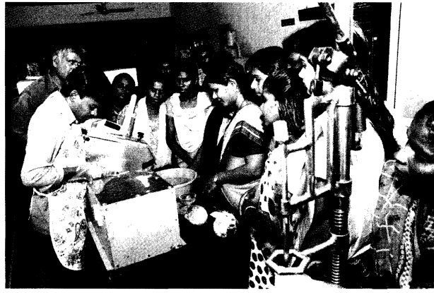
Training in preparing snow ball tender coconut

with enterprises like tender nut parlour, snow ball tender nut units etc.