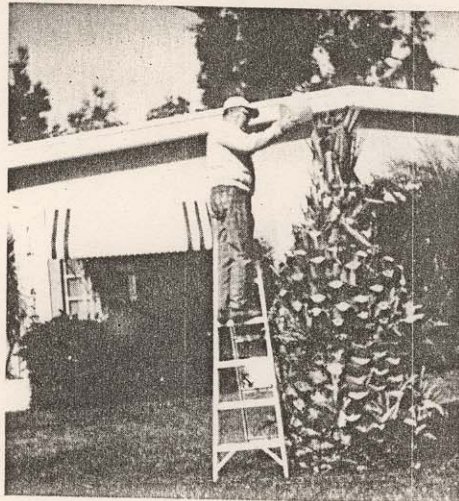
1. Treating my Canary Island date palm with BHC.

In order to get to the damaged fronds it was necessary to cut off all the fronds, so it was denuded (Fig. 1). In the very heart of the palm, I found a lot of damage where the insect had been working. I also found some of the pupal cases. This pupal case is made from coarse palm fibers and is about 2½ inches long. The larvae bore into the leaf sheath and, if left alone, can kill