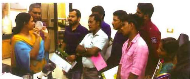
Keraprobio training in Microbiology lab, ICAR CPCRI, Kasaragod