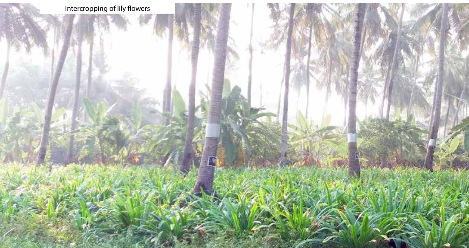
Intercropping of lily flowers

A fertilizer dose of 1000g nitrogen, 500g Phosphorous and 1000g of Potash per palm per year in three splits (June, October, and February) was recommended for coconut cultivation in sandy soils of the Konkani region of Maharashtra state. Making the palm nutritionally strong and healthy will equip it to survive against hot summer.