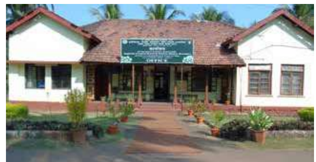
Regional Coconut Research Station Bhatye office

orchard and from one acre of this kind of system farmer can get one Lakh rupees, thus it is called as Lakhi Baug which includes model-I.