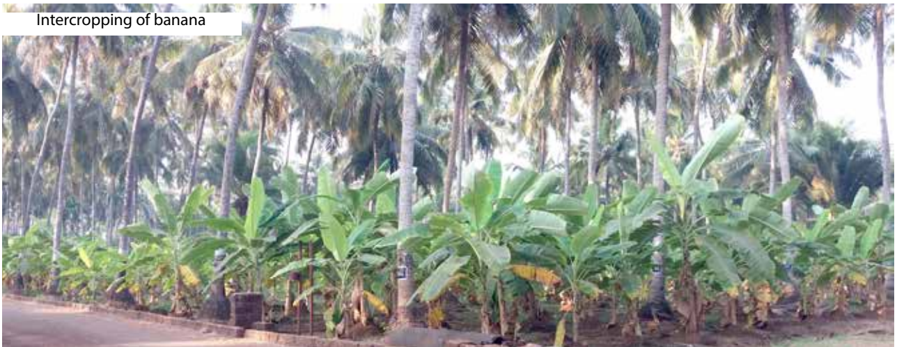
Intercropping of banana