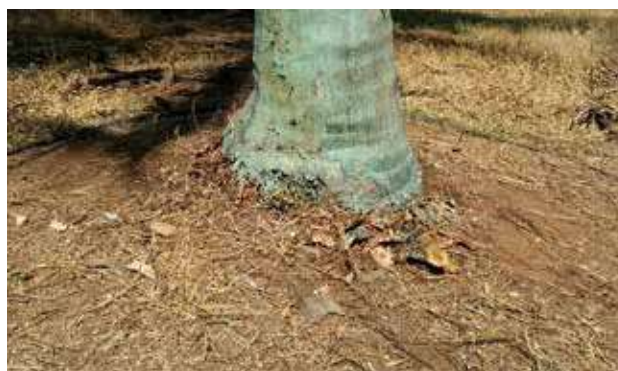
Bordeaux paste application

i) Mulching by dried coconut leaves, husk burial and the coir dust application is well known and is an adopted practice by most of the growers. This material acts as sponge and absorb water six times more of its weight.